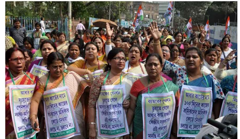
Women in Kolkata protest against the government's decision to link free lunch meals for children at state-run schools with Aadhaar cards.

News paper says it bought access to details from world's largest biometric database, used to administer public services